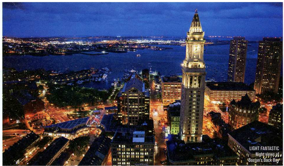
LIGHT FANTASTIC Night views of Boston's Back Bay

The Hotel Commonwealth is a stone's throw from Fenway. As soon as the bellhop opens the gilded front door, you step out into the middle of the game-day action. You can feel the pulse in the city. We hopped right into the deluge and made our way to the game. That's how you get there: You walk. That