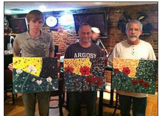
Male Paint Nite participants display their artwork at Alonso's in Baltimore