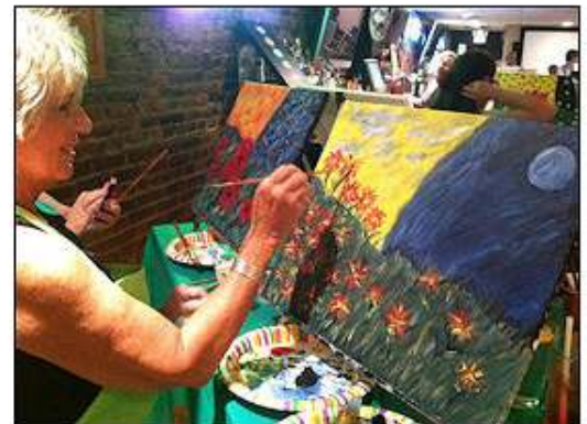
Paint Nite in action at Alonso's in Baltimore