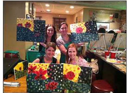
Paint Nite participants show off their finished products at Alonso's in Baltimore

Paint Nite instructors provide a different sample painting for each class, and then provide patrons step-by-step instructions on how to create that image themselves.